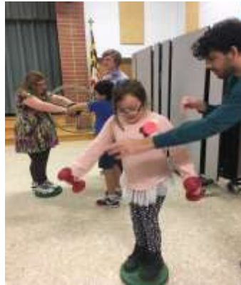
Below: St. Mary's College Physics Club visits Ridge Elementary School