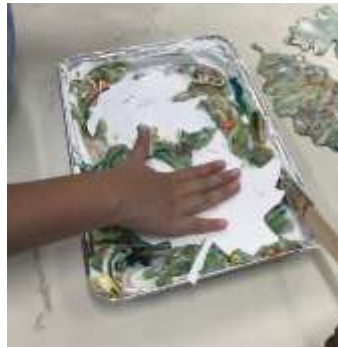
Above and left: George Washington Carver Elementary School paints using shaving cream and food coloring.